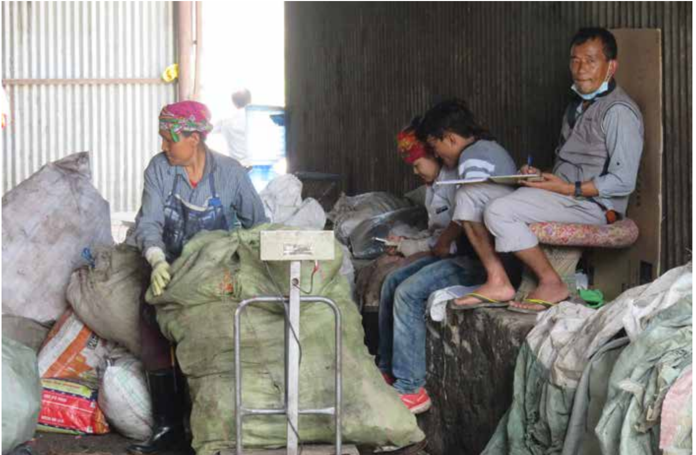
Women weighting bag of recyclable materials while men record the weight. At transfer station, Kathmandu, Nepal.

and experiences integral to the design, implementation, monitoring and evaluation of the waste management hierarchy. Gender mainstreaming is therefore relevant for all stakeholders and structures that connect with and influence the sector.