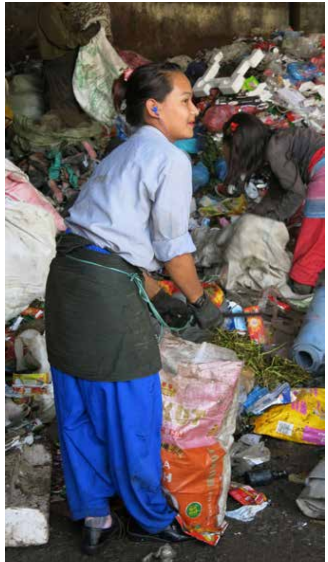
Young woman picking up recyclables at a transfer station. An interview with her co-worker revealed that a picker manages to collect about 50–60 kg plastic and 20–30 kg of textile a day.

Its primary purpose is to provide policymakers in these three countries with specific necessary information and a broad conceptual framework to guide policies aimed at bringing gender equality into the sector. The report also offers a broader reach through its analysis of the gendered nature of the waste sector, which could be widely applicable across other countries and contexts. Waste sector reforms, often driven by efforts to mitigate climate change emissions, are under way in many developing countries, which may find the guidance provided in the report useful.