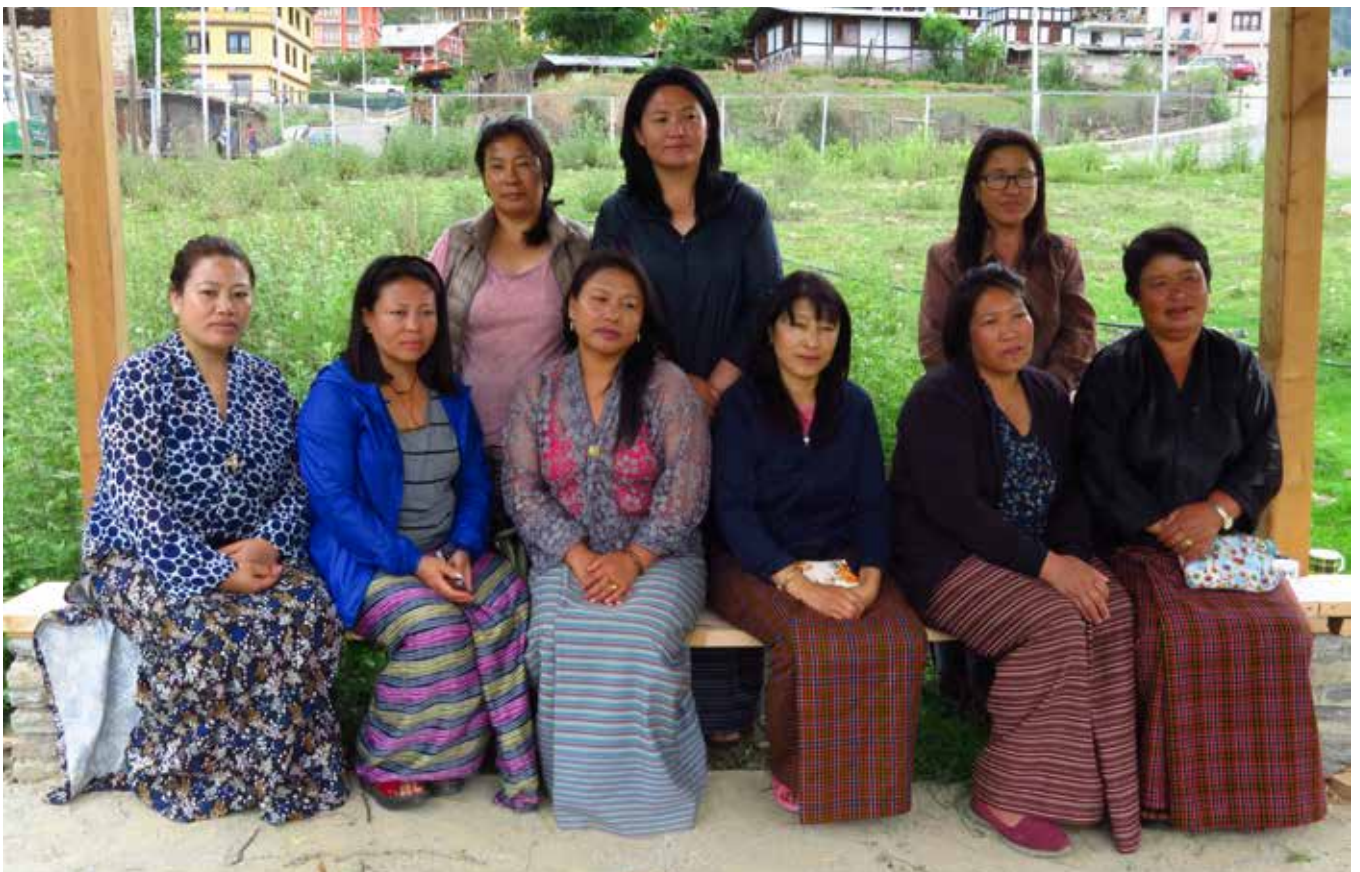
Group of women from the Taba & Dechencholing communities in North Thimphu who work together with the elected community leader to keep their neighbourhood clean.