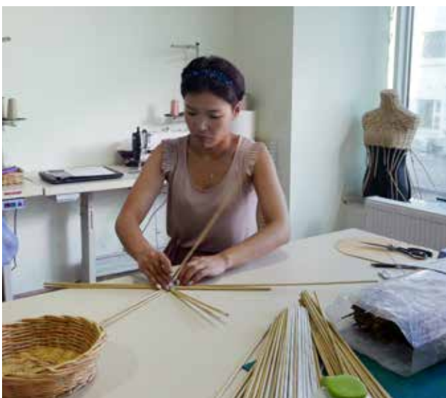
An artist-entrepreneur making materials from recycled paper, Ulaanbaatar, 2018.