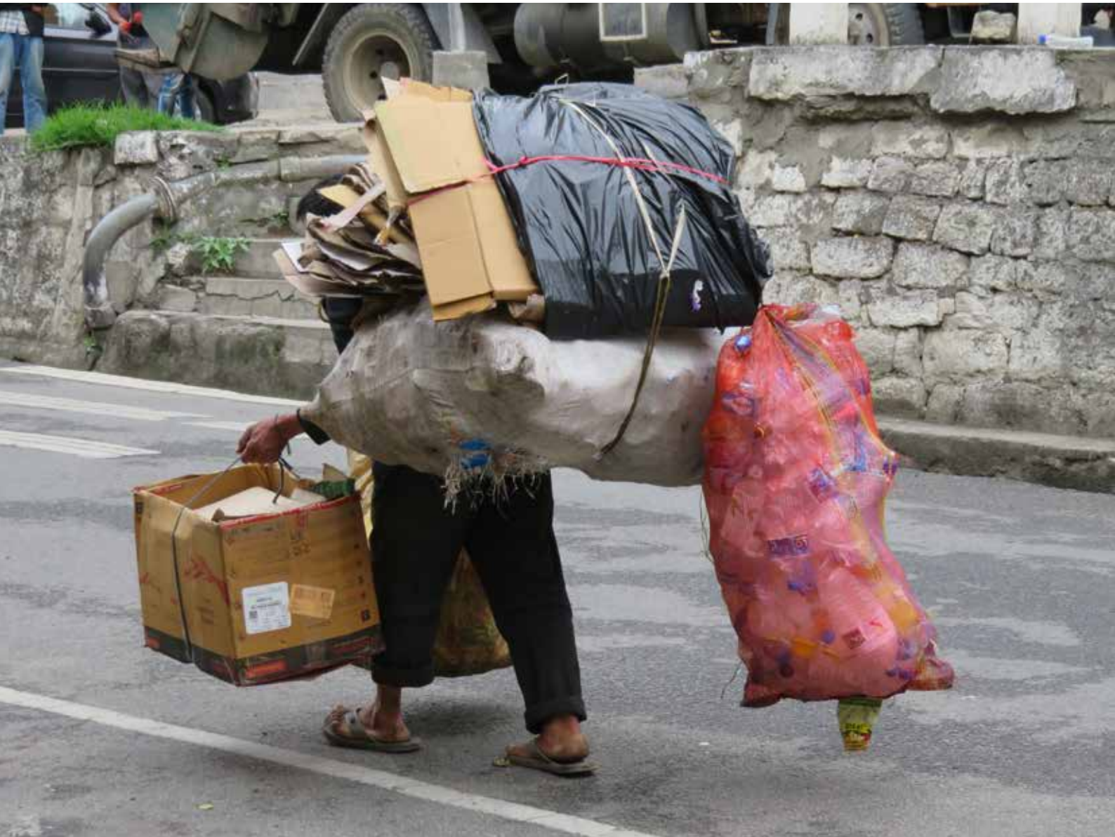
A waste picker in the streets of Thimphu, Bhutan.