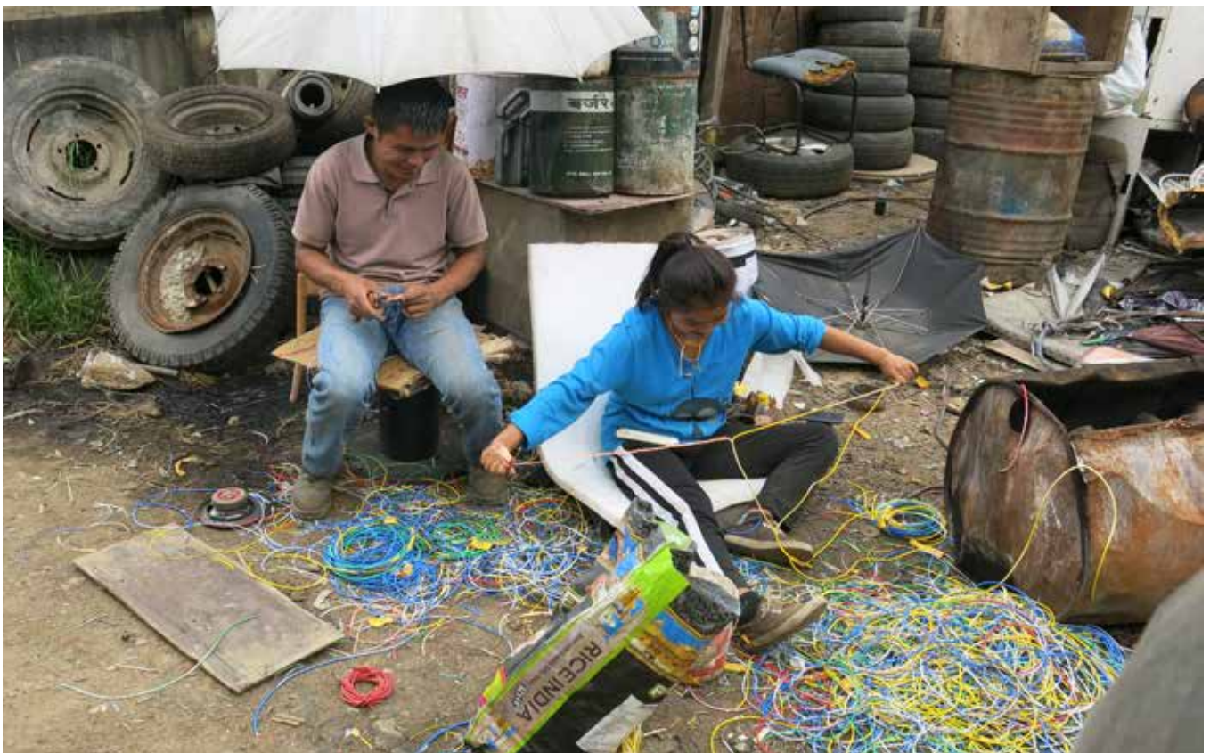
Workers at a scrap yard remove copper wires from electric wires. The young woman pictured is paid about US$ 43 per month because she lived at the scrap yard owner's house and did not have to pay for food or rent. The man pictured is older and receives US$ 115 per month – he lives independently. The owner travels to India once every month or two months to sell goods.