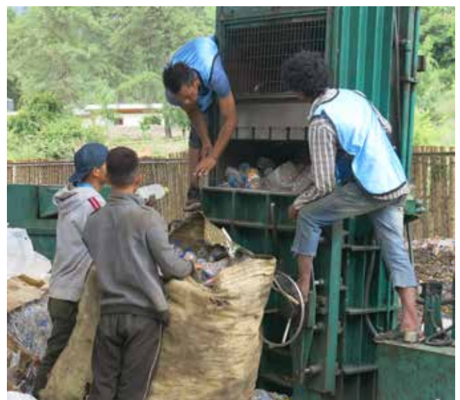
A group of men at Greener Way are compressing PET-bottles at the transfer station.