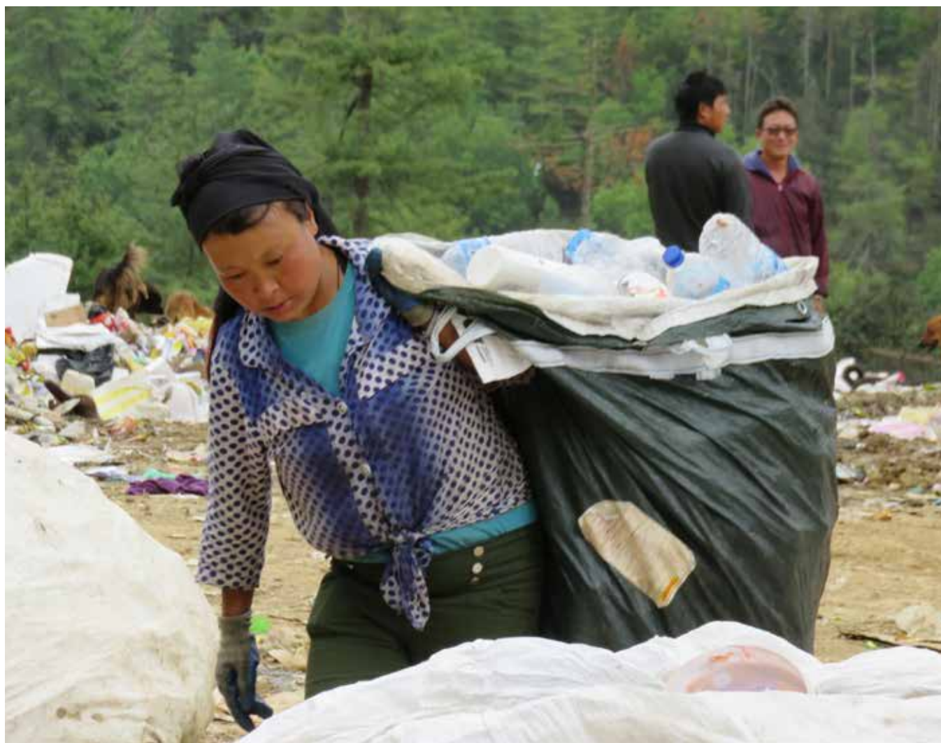
A waste picker from Greener Way at the Memelakha landfill (Thimphu's landfill) earning around 100 US $ per month and working about three days per week at the transfer station and three days per week at the landfill (Greener Way organises transport).