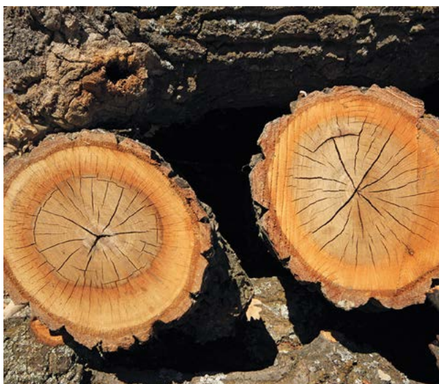
Mahogany wood. Trading mahogany species is restricted by the Convention on International Trade in Endangered Species of Wild Flora and Fauna (CITES).

We proceed in the following steps. Following this introduction, step two reviews how the problem of “illegal logging” emerged on the international agenda. Step three reviews leading policy interventions that resulted from this policy framing. Step four reviews developments in selected countries/regions around the world according to their place on the global forest products supply chain: consumers (United States, Europe and Australia); middle of supply chain manufacturers (China and South Korea) and producers (Russia; Indonesia; Brazil and Peru; Ghana, Cameroon and the Republic of Congo). We conclude by reflecting on key trends that emerge from this review relevant for understanding the conditions through which legality might make a difference in addressing critical challenges.