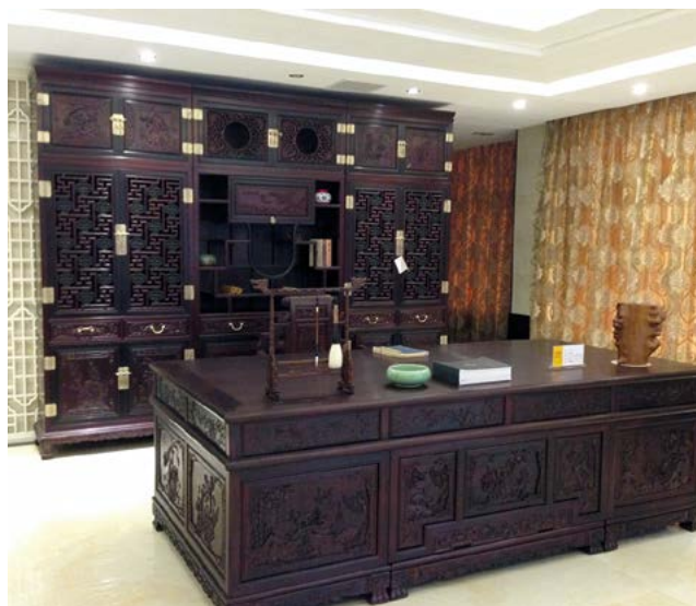
Office furniture made from rosewood (China)

Given that individual countries decided whether, and how, to implement the EUTR, it is also important to note divergent uptake/implementation within Member countries (Sotirov et al., 2015). In general, scholars have found weak implementation within poorer Eastern European countries such as Bulgaria and Romania (Gavrilit et al., 2015) as well as in Southern Europe, particularly in Greece, Italy and Spain (Sotirov et al., 2015). Other scholars have found increasing coordination between EUTR implementation and FLEGT VPA processes, owing for example to the creation of the European Commission’s EUTR/FLEGT Expert Group, an informal enforcement network convened by EU Member State Competent Authorities, and the Timber Regulation Enforcement Exchange (TREE) network organized by Forest Trends, which brings together environmental