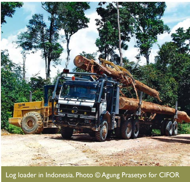
Log loader in Indonesia.

In 2003, the Indonesian government appeared, on paper, to step up its efforts by completing a draft TLAS, formally known by its Indonesian name, Sistem Verifikasi Legalitas Kayu (SVLK). However, four years later, drafting was still not complete, leading many non-governmental organizations and international agencies to question Indonesia's resolve to follow through on its commitments. Yet by late 2007, draft legislation was submitted by the Indonesian negotiators to the Ministry of Forests for approval, and, in 2009 the SVLK was signed into law. In a departure from previous efforts that were criticized as limited, independent third parties were charged with auditing compliance with Indonesian law (Luttrell et al., 2011). In addition, civil society is empowered to provide independent monitoring and to submit objections. In sum, the case of Indonesia displays a progression from no support in 1999, to weak support in 2001, to formal and legislated commitments in 2009, followed by increasing support since this time. This ongoing support was matched by increasing roles for stakeholder groups to participate in standard development processes. Civil society representatives were successful in championing good forest governance, transparency and accountability, as well as supporting third party auditing and independent monitoring.